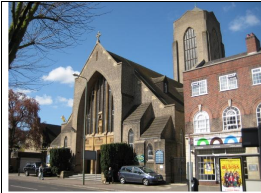
St Edmund RC Church