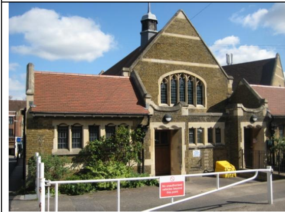
Christ Church Halls