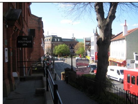
Southwards out of the St George's conservation area. Old Police Station in the left foreground and the BT telecom exchange in the background.