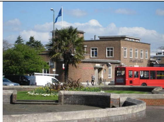
Beckenham Post Office