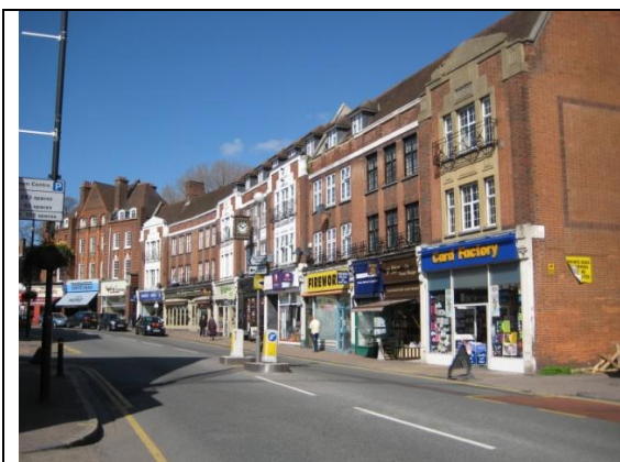
High Street with no 134 in the foreground.

There are no views of a planned nature but the organic development and historic nature of the town centre means that glimpse of the various church spires are often visible and some of the better individual buildings on the High Street contribute to some pleasant streetscapes. As previously mentioned views into the High Street area from the west are dominated by the Odeon and the War Memorial.